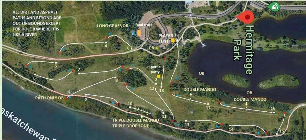
*River City Cup 25 layout shown.